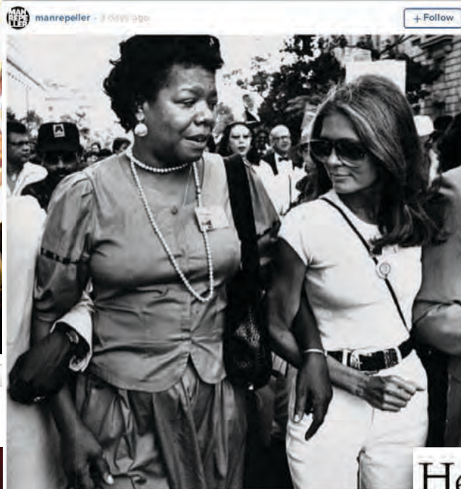
Women rule. #internationalwomensday #makeithappen

Elizabeth Banks @ElizabethBanks Happy #InternationalWomensDay! Shout out to all the sparkling goddesses in the world. Shine on, you crazy diamonds.