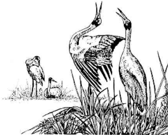
Brolga, Grus rubicunda (illustration by Susanna Haffenden)