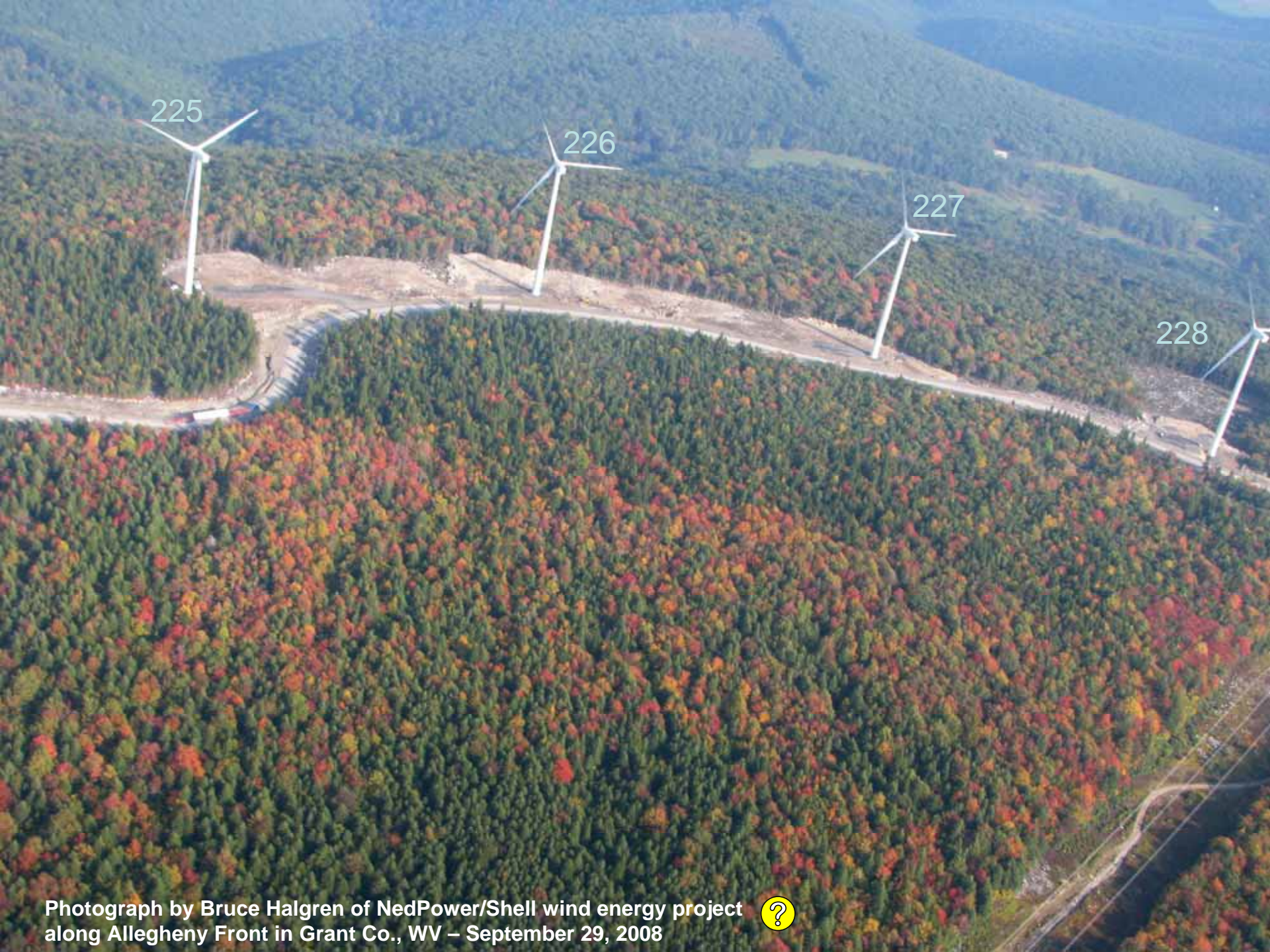
Photograph by Bruce Halgren of NedPower/Shell wind energy project along Allegheny Front in Grant Co., WV – September 29, 2008