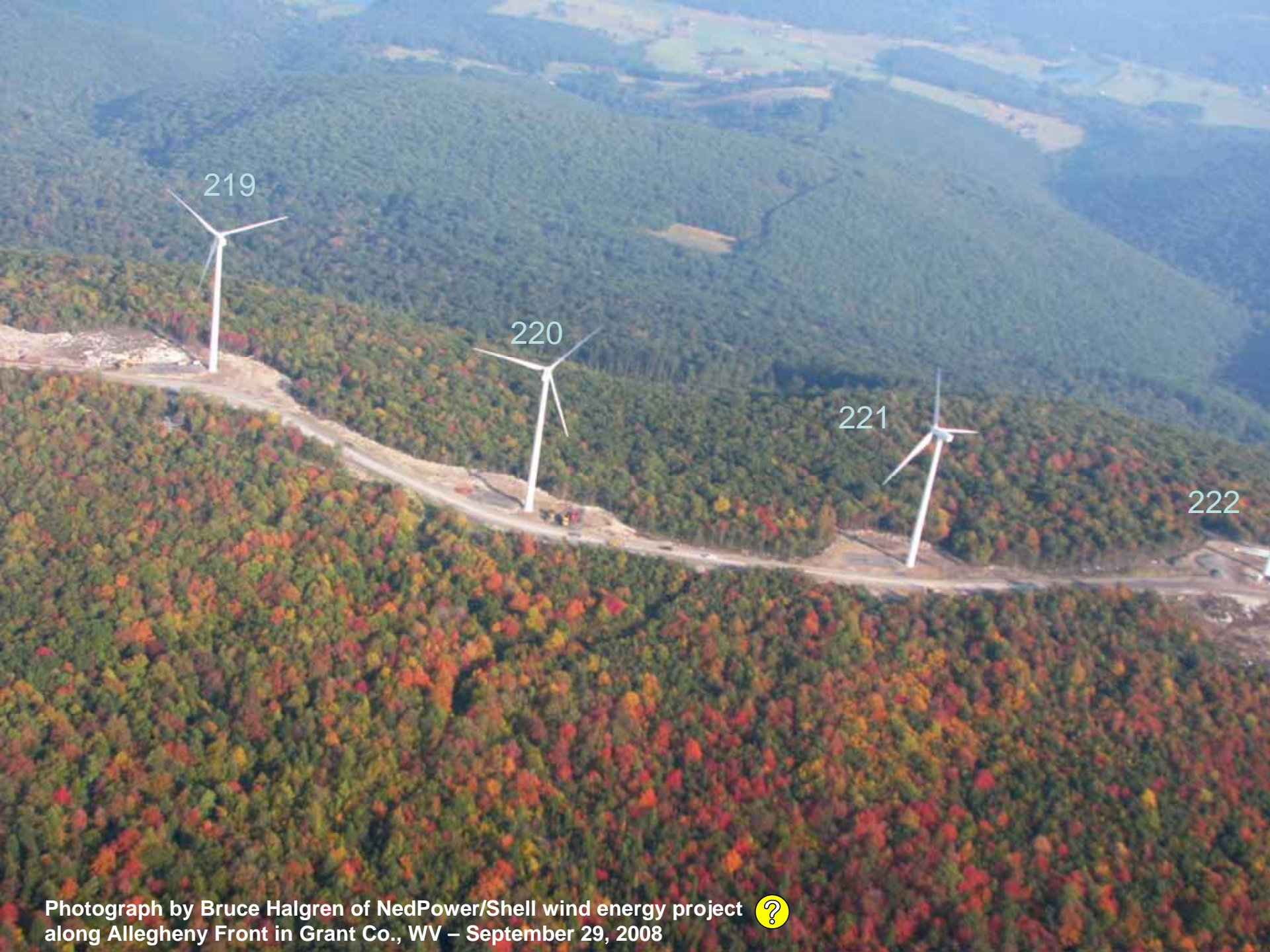
Photograph by Bruce Halgren of NedPower/Shell wind energy project along Allegheny Front in Grant Co., WV – September 29, 2008