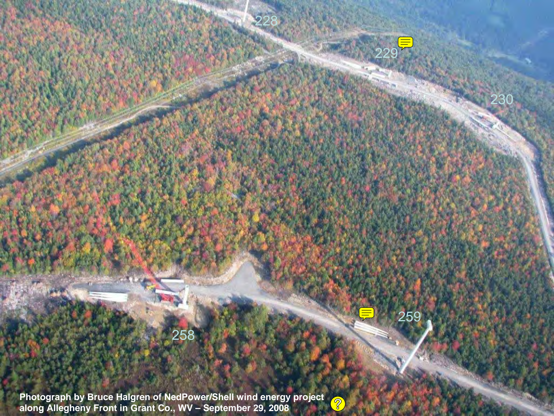
Photograph by Bruce Halgren of NedPower/Shell wind energy project along Allegheny Front in Grant Co., WV – September 29, 2008