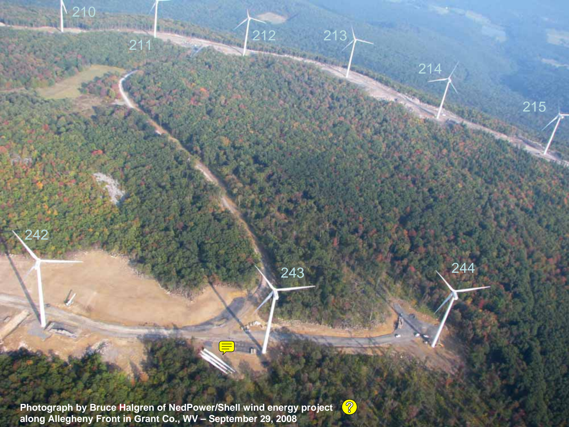
Photograph by Bruce Halgren of NedPower/Shell wind energy project along Allegheny Front in Grant Co., WV – September 29, 2008