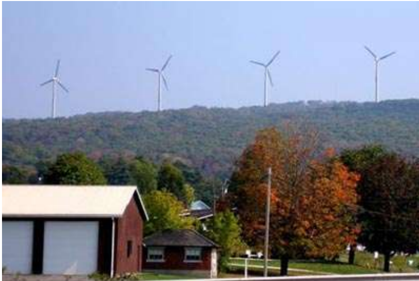
375 Foot Turbines Over Meyersdale, PA