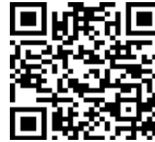
Scan for Guest Card

Welcome guest! We're so glad you've come to worship with us this morning. Please help us to get to know you better by filling out the green guest card on the back of the seat in front of you and dropping it in the collection basket. Or, for your convenience, you may scan the QR code and complete the guest card digitally. Thank you for taking the time to attend our service today. We hope to see you again soon!