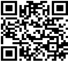
Scan for Guest Card

Welcome guest! We’re so glad you’ve come to worship with us this morning. Please help us to get to know you better by filling out the green guest card on the back of the seat in front of you and dropping it in the collection basket. Or, for your convenience, you may scan the QR code and complete the guest card digitally. Thank you for taking the time to attend our service today. We hope to see you again soon!