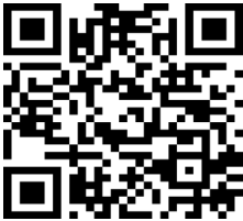
Scan for Guest Card

Welcome guest! We’re so glad you’ve come to worship with us this morning. Please help us to get to know you better by filling out the green guest card on the back of the seat in front of you and dropping it in the collection basket. Or, for your convenience, you may scan the QR code and complete the guest card digitally. Thank you for taking the time to attend our service today. We hope to see you again soon!