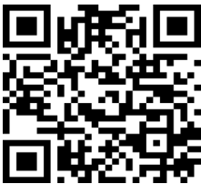
Scan for Guest Card

Welcome guest! We’re so glad you’ve come to worship with us this morning. Please help us to get to know you better by filling out the green guest card on the back of the seat in front of you and dropping it in the collection basket. Or, for your convenience, you may scan the QR code and complete the guest card digitally. Thank you for taking the time to attend our service today. We hope to see you again soon!