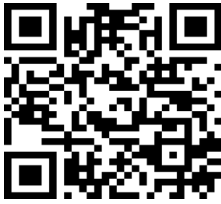
Scan for Guest Card

Welcome guest! We’re so glad you’ve come to worship with us this morning. Please help us to get to know you better by filling out the green guest card on the back of the seat in front of you and dropping it in the collection basket. Or, for your convenience, you may scan the QR code and complete the guest card digitally. Thank you for taking the time to attend our service today. We hope to see you again soon!