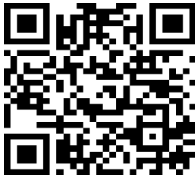
Scan for Guest Card

Welcome guest! We're so glad you've come to worship with us this morning. Please help us to get to know you better by filling out the green guest card on the back of the seat in front of you and dropping it in the collection basket. Or, for your convenience, you may scan the QR code and complete the guest card digitally. Thank you for taking the time to attend our service today. We hope to see you again soon!