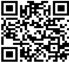
Scan for Guest Card

Welcome guest! We’re so glad you’ve come to worship with us this morning. Please help us to get to know you better by filling out the green guest card on the back of the seat in front of you and dropping it in the collection basket. Or, for your convenience, you may scan the QR code and complete the guest card digitally. Thank you for taking the time to attend our service today. We hope to see you again soon!