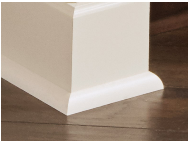
Furniture Base Moulding On top of Shoe Moulding