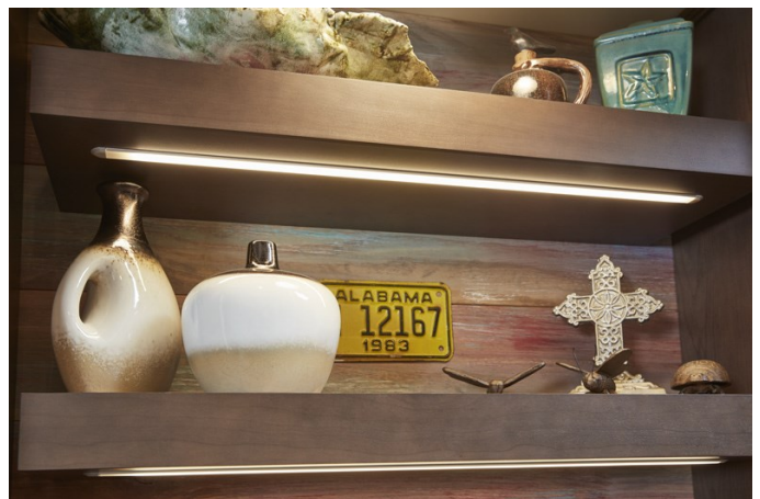
Floating Shelves with Prepped for