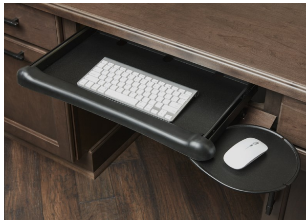
Keyboard Drawer with Slide Out Mouse Tray