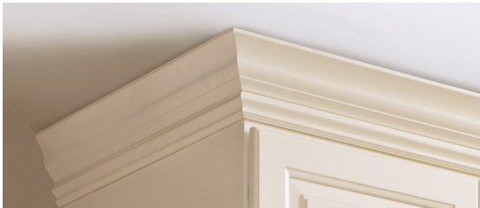
Decorative Crown Moulding

Our designer chose a Millbrook door style in Cherry finished in a Drift stain for the base cabinets as well as the middle wall cabinets complete with matching finished ends. For the upper tall cabinets, a complimentary Bedford Square door style in Maple with our Divinity paint leads your eyes up to the Decorative Crown and Large Cove Light Rail Crown Moulding and finished shelving that cap off the workspace. Below the upper cabinets, our Large Cove Light Rail Moulding gives a nice finish for the bottom of the upper wall cabinets. 87" tall side pilasters in matching Divinity paint are positioned on either end to support the space and show that this desk is an independent yet separately contained area. This tall pilaster is one of many new cabinet sizes and accessories that have been added in the mid-price point Select Series.