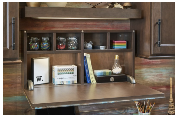
Hidden Drop-Down Desk – You Draw It Program