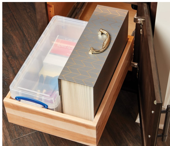
Cabinet with Sliding Shelf