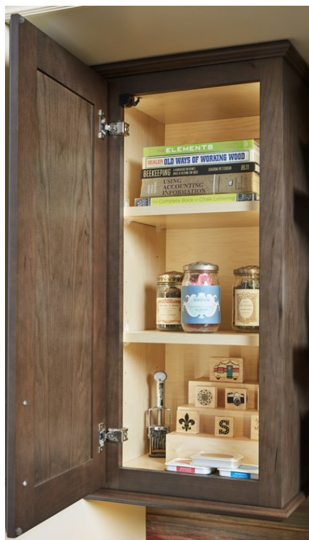
Three-Tiered Spice Storage Shelf

No space was wasted as each drawer and cabinet has a purpose. On either side of the center shelving, there are spice racks normally used in the kitchen but serve a great purpose for storing items like paint or office supplies. The Wooden Three-Tiered Spice Rack attached to the inside of the cabinet door below organizes paint. The addition of the Tiered Wooden Spice Storage Shelves to both cabinets' lower shelves allows each item to be visible and easy to reach.