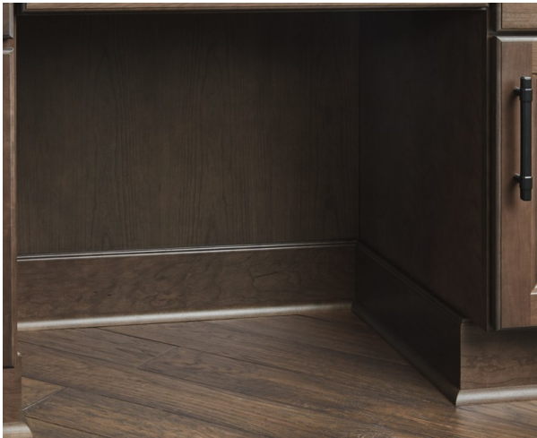
Matching Back Panel

As you can see, no detail was left unattended. The sides of the lower cabinets are capped with flush matching end panels. Moulding is on both the top and bottom of the wall cabinet for an elegant clean look. Wainscot Cap Moulding on the bottom of each wall cabinet are both beautiful and hide the installed functional lighting. Under the keyboard drawer, the back wall is finished with a matching back panel to make one cohesive look. Base Mouldings at the bottom of the cabinetry provide a built-in finished look.