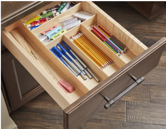
Cutlery Drawer Organizer

The wooden countertop of the entire desk is stained to match the cabinetry and is finished with an edge moulding. In the center, behind a flip-down drawer front rests our pull-out keyboard tray complete with a slide out space for a mouse. On either side of the keyboard tray, drawers provide ample storage. On one side is a Birch cutlery drawer organizer that can be used for pencils, pens, paint brushes, or other supplies that could be used for office or crafting supplies. On the other side are shallow multi-functional Birch drawer components for keeping everything in place.