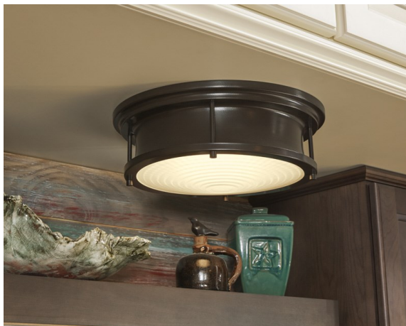
Shiplap Back Wall