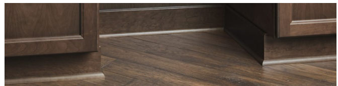
Furniture Base Moulding On top of Shoe Moulding