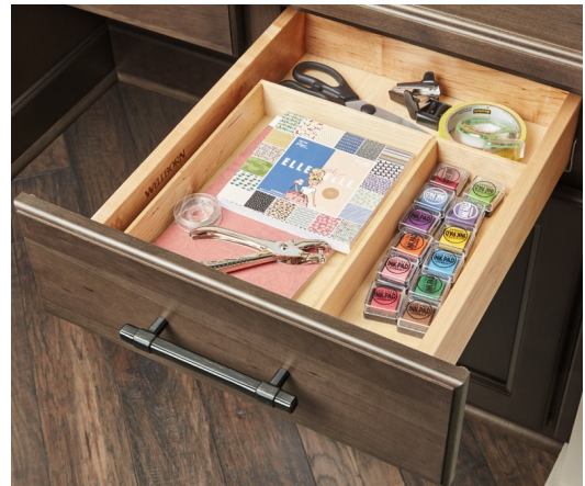
Shallow Drawer Storage Box