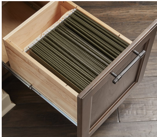
Desk File Drawer