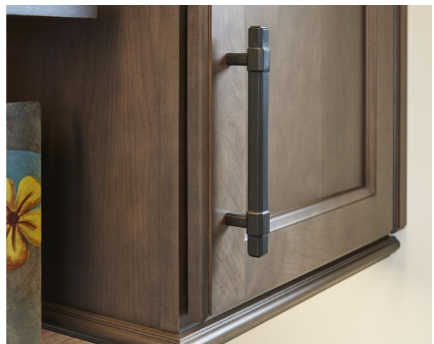
Flush Matching End Panels