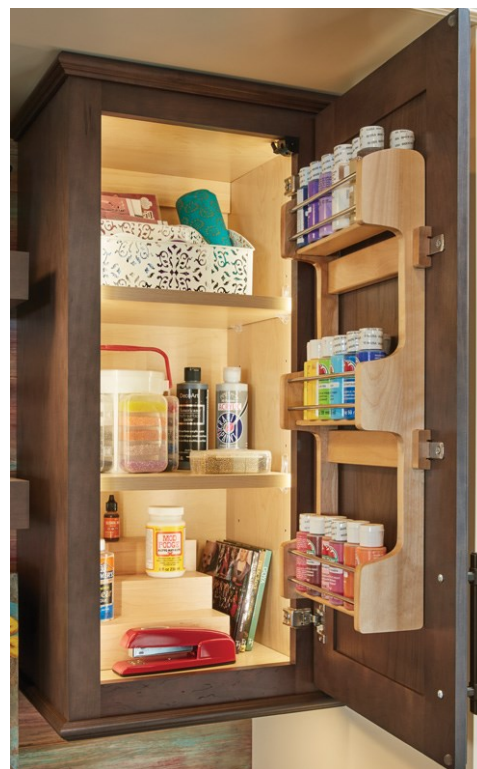
Three-Tiered Wooden Spice Rack