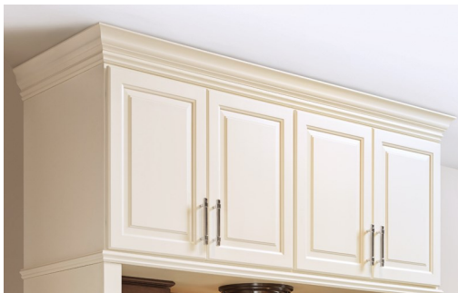
33" High Wall Cabinets