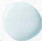
VALSPAR® Dreamy Clouds

The modern American blacksmiths at Hubbardton Forge crafted a trio of wrought-iron and blown-glass pendants for added visual interest and task lighting above the island.