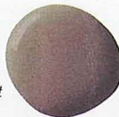
VALSPAR® Copper Adobe Brown