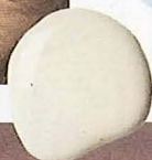
VALSPAR® Homestead Resort Jefferson White