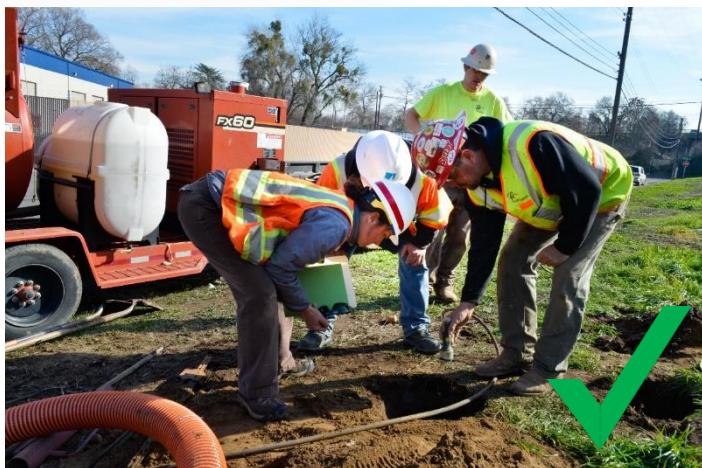
Crew looks for a buried gas line after potholing. (*8)

OSHA Standard 1926.651(b)(1) states that the estimated location of utility installations, such as sewer, telephone, fuel, electric, water lines, or any other underground installations that reasonably may be expected to be encountered during excavation work, shall be determined prior to opening an excavation.