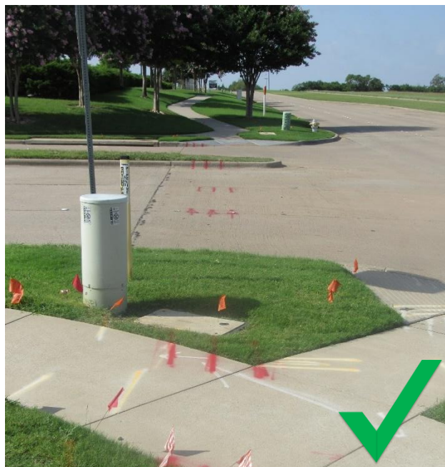
Example of located intersection and curb area. Note electricity is marked in red paint, telephone in orange flags, and gas is marked in yellow paint.