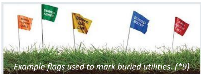
Example flags used to mark buried utilities. (*9)

OSHA Standard 1926.651(b)(2) says that utility companies or owners shall be contacted within established or customary local response times, advised of the proposed work, and asked to establish the location of the utility underground installations prior to the start of actual excavation.