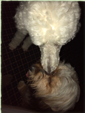
Archie and Canine Flu