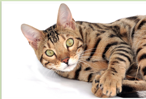
Isis and Asthma