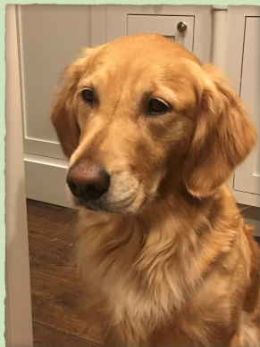
Cheers and Kennel Cough