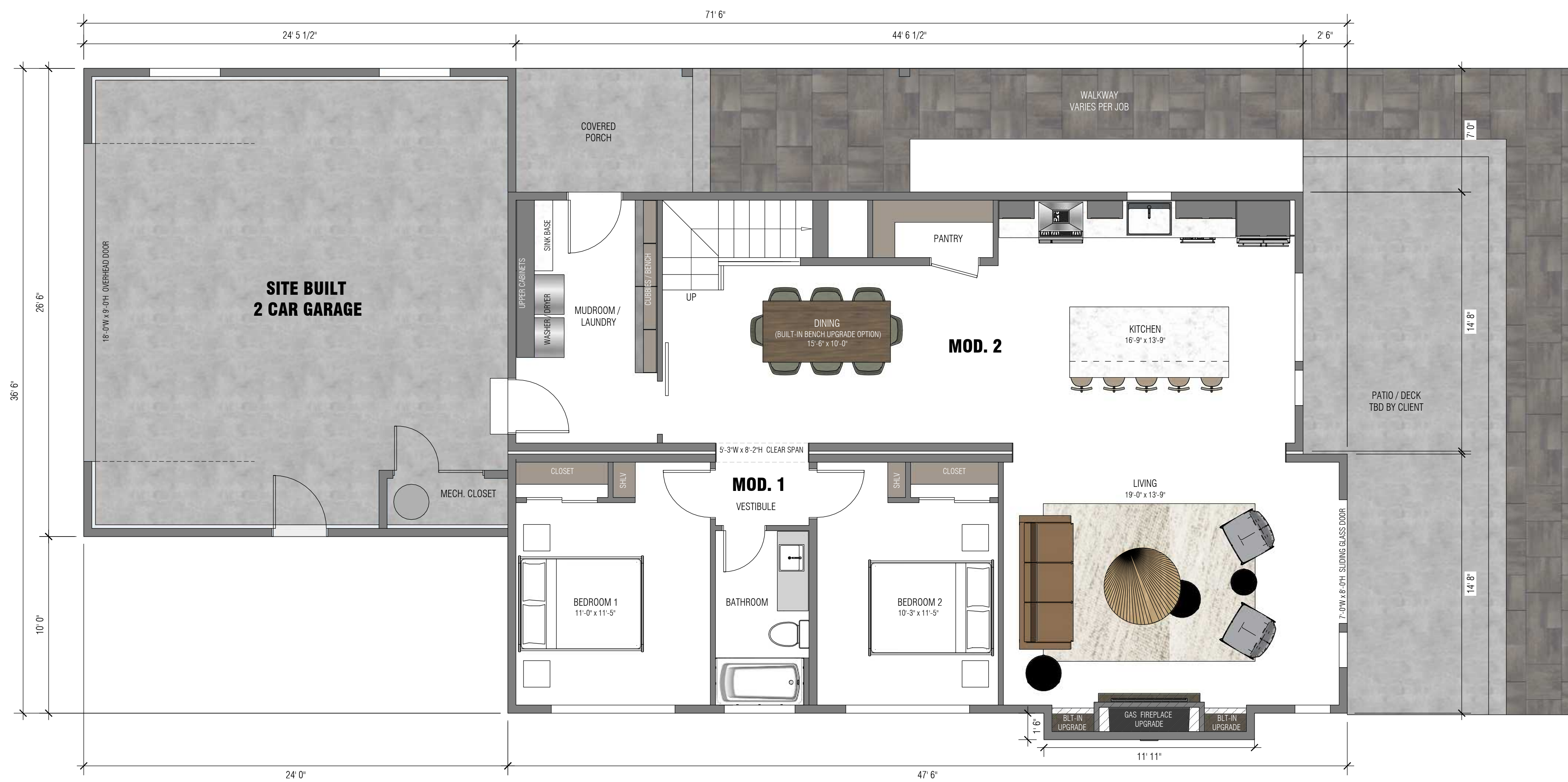
FLOOR PLAN: MAIN LEVEL