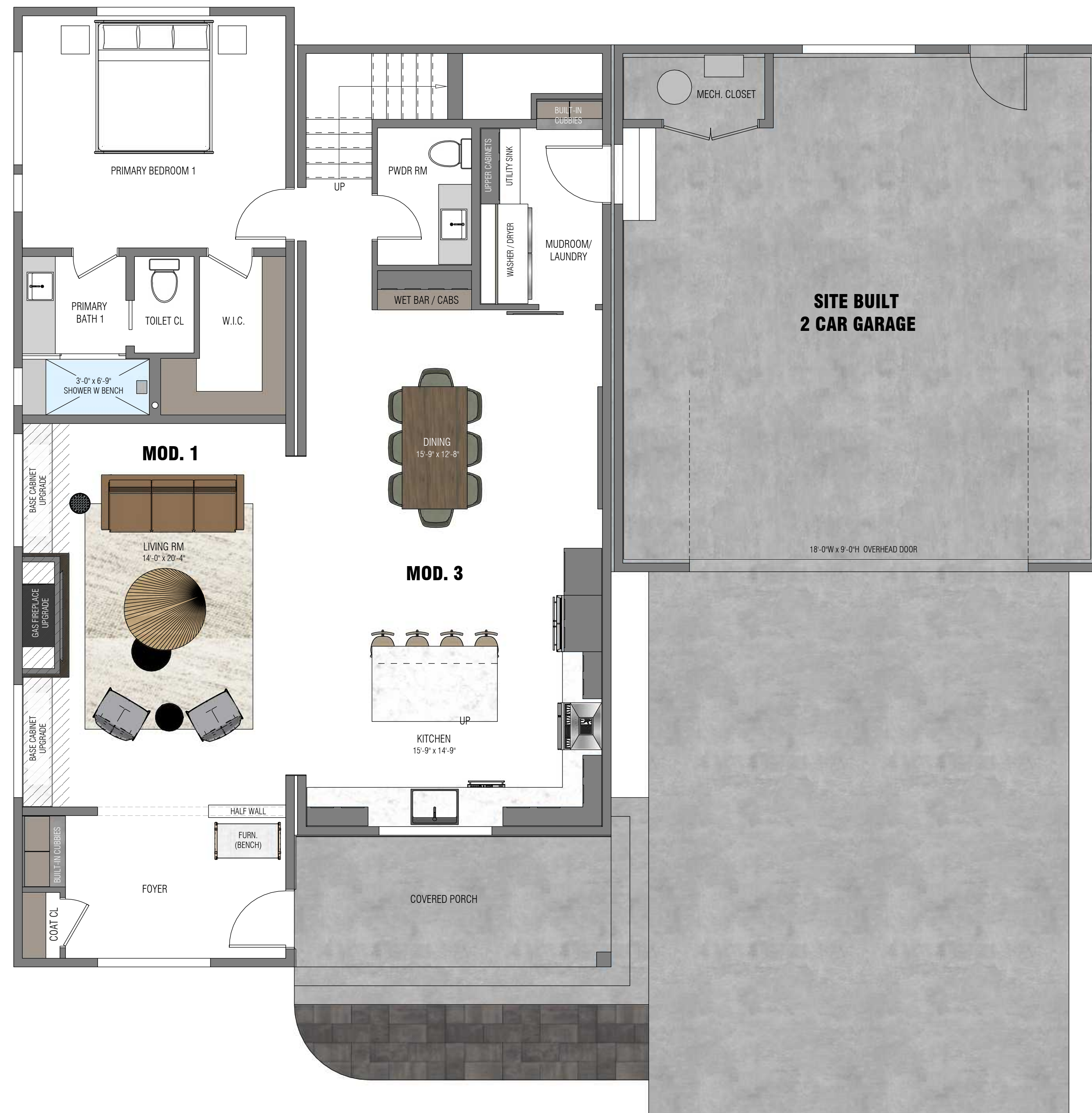
FLOOR PLAN: MAIN LEVEL SCALE: 1/4" = 1' 0"