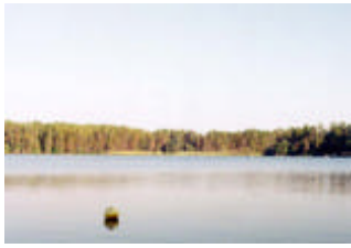
Protected wetlands border the lake's southeast corner

The lake is bordered by wetlands, swamp and residential development. The southeast corner of the lake is the site of a protected wetland that is home to a variety of wildlife including deer, alligator, heron and osprey. Bob often takes his cue from the osprey, "...you can hear them, especially in the spring when they start pulling their chicks out of the nest... Whenever I go fishing on the lake, I know it will be best when the ospreys are flying because they