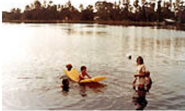
Members of the Cold family swimming with friends in 1977