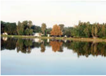
The west side of Lake Keene was originally developed in the 1940s

David cites several occurrences which have had negative effects on the quality of Lake Keene's water. These occurrences started with the initial residential development of Lake Keene, which was followed by the advent of the St. Petersburg well fields pumping station, and the creation of a sewage treatment plant north of the county line.