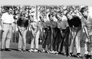
1970 ACC Champions