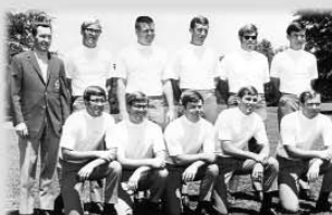
1969 ACC Champions