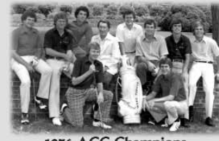
1976 ACC Champions