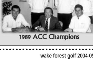
1989 ACC Champions