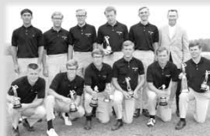
1968 ACC Champions