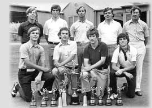
1973 ACC Champions