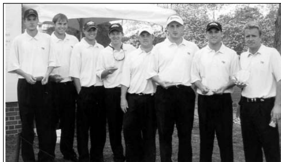
The 2002 Demon Deacons (left) after capturing The Intercollegiate.

All-Dixie Intercollegiate (F) Pinehurst Intercollegiate (F) Furman Intercollegiate (S) Big Four Tournament (S) ACC Championship (S) Chris Schenkel Intercollegiate (S) NCAA Championship (S)