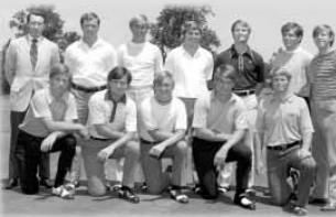
1971 ACC Champions