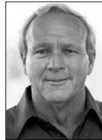
Arnold Palmer (1949, 1950)