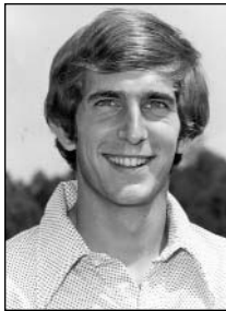
Jay Haas (1975)