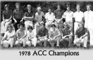
1978 ACC Champions