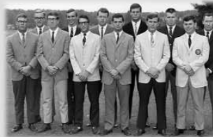
1967 ACC Champions