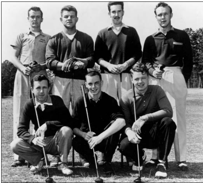
The 1954 Wake Forest golf team, which included Arnold Palmer (back row, far right), played in the first year of Atlantic Coast Conference competition.