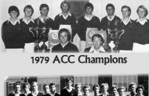
1979 ACC Champions