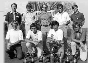
1972 ACC Champions