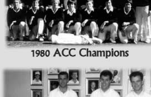
1980 ACC Champions