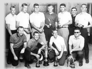
1963 ACC Champions