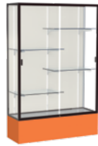
374 4' (48"W) Floor Case