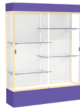
3175 5' (60"W) Floor Case