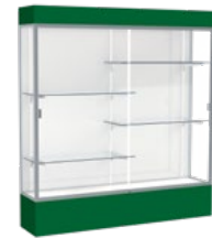
3176 6' (72"W) Floor Case