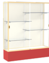
375 5' (60"W) Floor Case