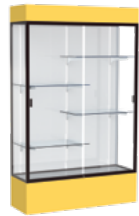
3174 4' (48"W) Floor Case