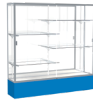
376 6' (72"W) Floor Case