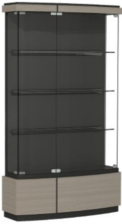
511 - 42" floor case (pictured in elm) laminated case with 3 full-length shelves 73"H x 42"W x 12"D