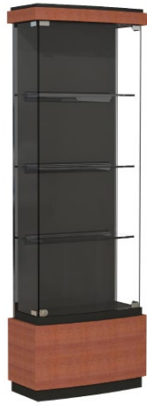
512 - 29" floor case (pictured in cherry) laminated case with 3 full-length shelves 73"H x 29"W x 12"D