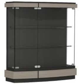
514 - 42" wall case (pictured in elm) laminated case with 2 full-length shelves 44"H x 42"W x 12"D