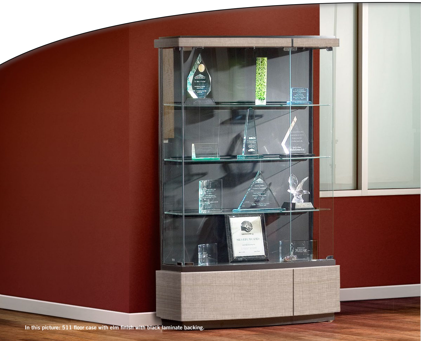
In this picture: 511 floor case with elm finish with black laminate backing.