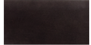
Java (Poplar Only)