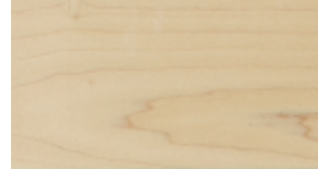
Natural (Knotty Pine Only)