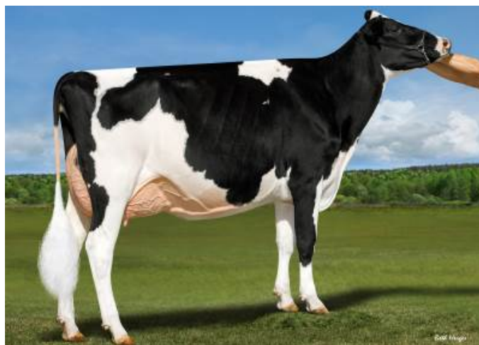
Full Sister: Genosource Looks Matter-ET VG-89-2Y

Bisablo: Val-Bisson Doorman TD TL TP TR TV TY Bisabla: Rosedale Lexington-ET VG-89