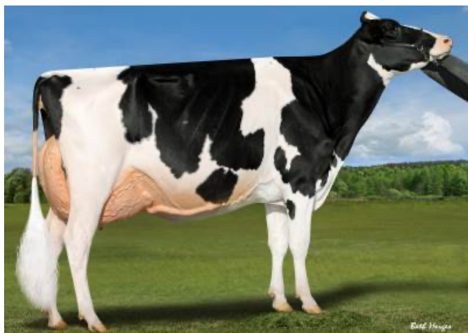
Madre: Ladyrose Caught Your Eye-ET