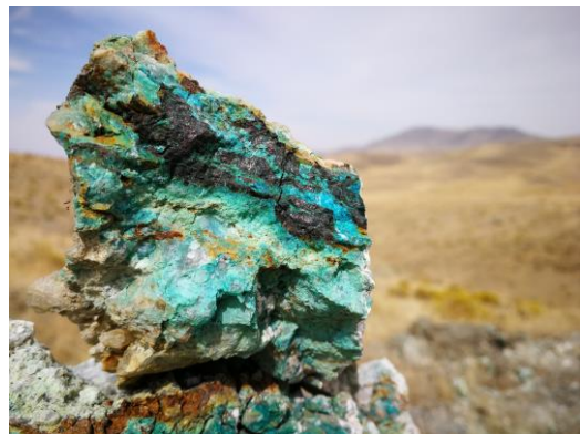
Junction Property, Copper-Silver Veins, Nevada