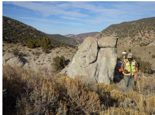
Danbo Property, Tertiary Epithermal Gold, Nevada