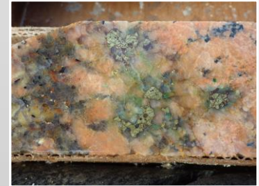
JUNCTION PROPERTY mCret. Copper-Silver Porphyry