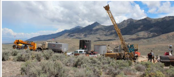
BONITA PROPERTY Jurassic Copper-Gold Porphyry