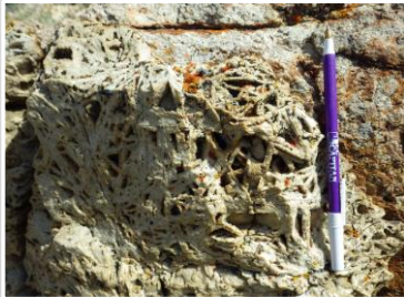
BIG TEN PROJECT Tertiary Epithermal Gold-Silver