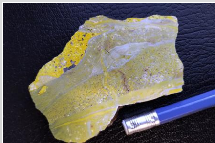
AMSEL TARGET, BIG TEN, NEVADA Banded adularia in Tuffsite