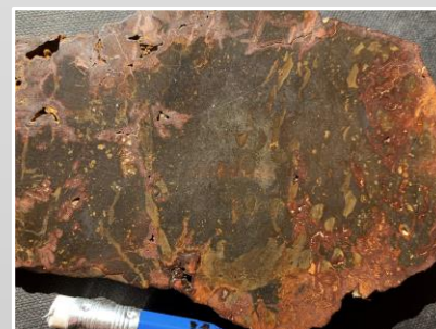
RANOKE PROPERTY, ONTARIO iron oxide copper-gold breccia