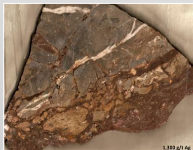
REVEILLE PROJECT, NEVADA Silver in lmst. breccia; CRD system