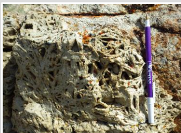
BIG TEN PROJECT Tertiary Epithermal Gold-Silver