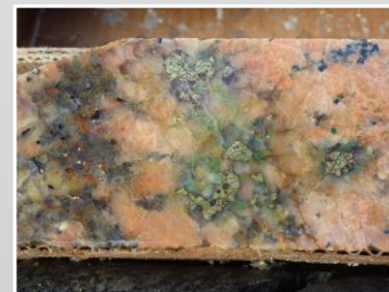
JUNCTION PROPERTY mCret. Copper-Silver Porphyry