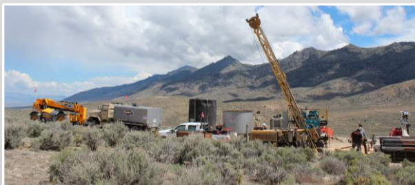
BONITA PROPERTY Jurassic Copper-Gold Porphyry