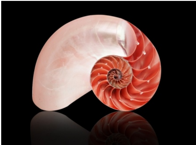
A fractal design shows up in every scale. From the smallest shell...

So naturally I wondered if this could be applied to video. And in analyzing this particular video I was pleasantly surprised. What's more, it was obvious that these principles could be grasped intuitively by anyone, even if they could not express them objectively.