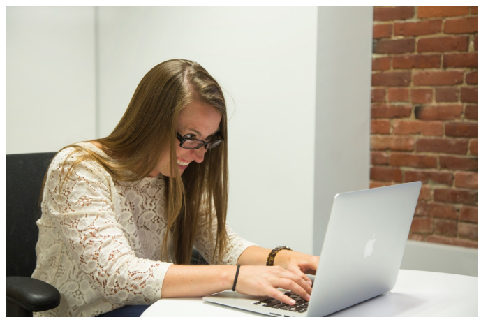
Humor, being smack in the middle of the emotional spectrum, is very popular.

Finally, on the other end we have old familiar lust. The spectrum here starts with the pretty girl with a come-hither smile sporting an orange hunting vest selling roofing tile, to a sparkling sedan containing a movie star musing on his backstory as he speeds into the the nighttime metropolis; all the way to a molded piece of aluminum playing 1000 songs in your pocket.