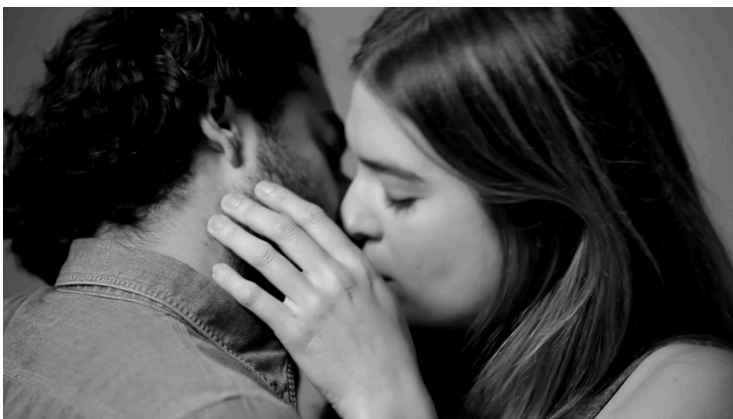
"First Kiss" bolted Sentiment onto Lust and created a viral sensation.

The most-shared viral ad of 2014 was First Kiss, a video made by an unknown clothing