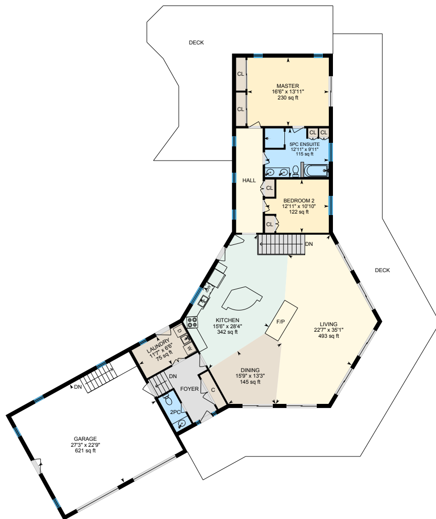
Main Floor Exterior Area 2106 sq ft

Main Building: Total Exterior Area Above Grade 2106 sq ft