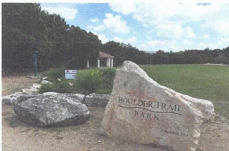
Boulder Trail Park