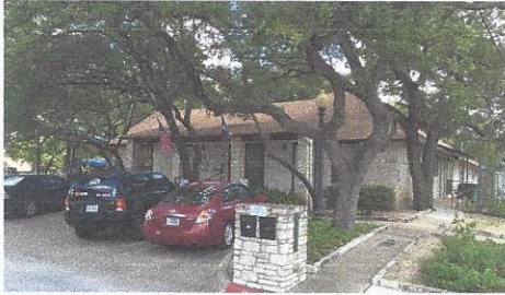
LD Office & Community Center