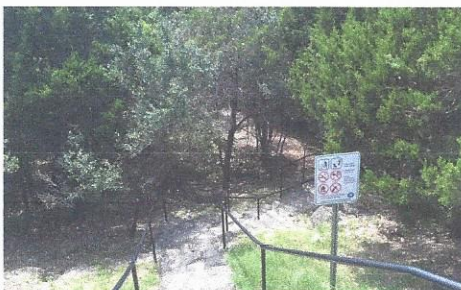
Whitemarsh Valley Nature Trail