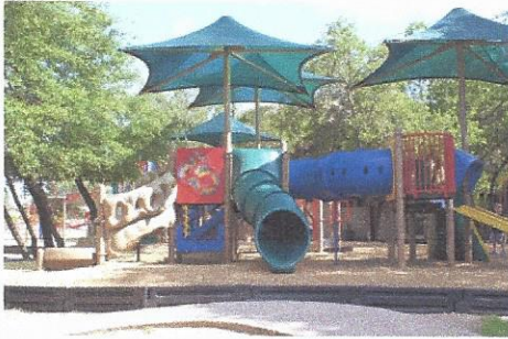
Lost Creek Boulevard Park