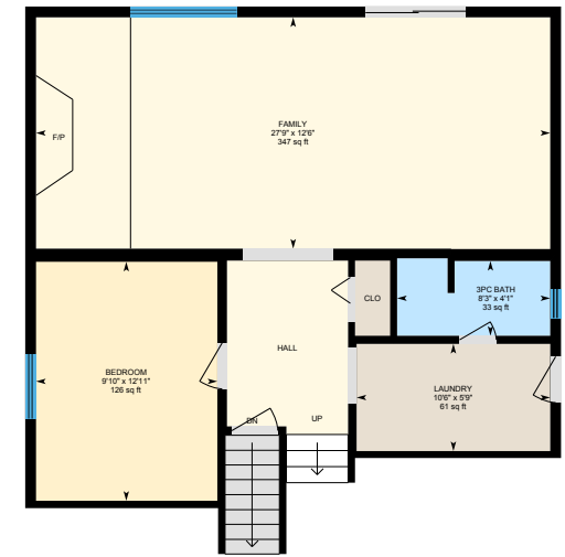
Lower Exterior Area 743.03 sq ft