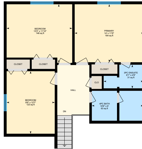
2nd Floor Exterior Area 759.24 sq ft