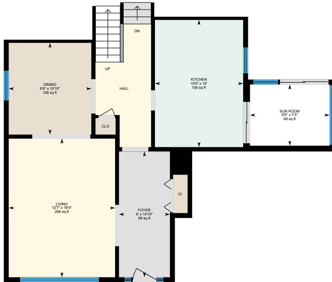
Main Floor Exterior Area 745.49 sq ft

Main Building: Total Exterior Area Above Grade 3799.57 sq ft