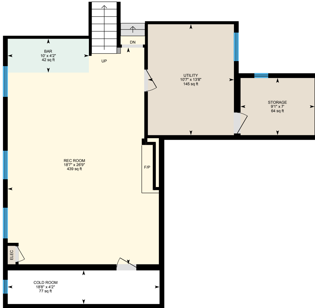
Basement Exterior Area 801.46 sq ft

Main Building: Total Exterior Area Above Grade 3799.57 sq ft