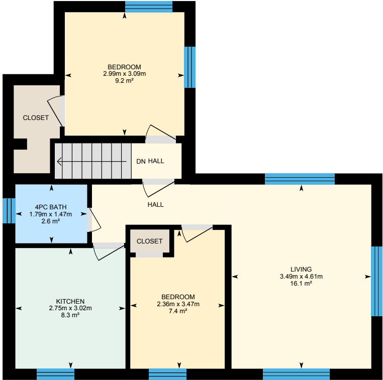
Upper Floor Exterior Area 67.2 m 2