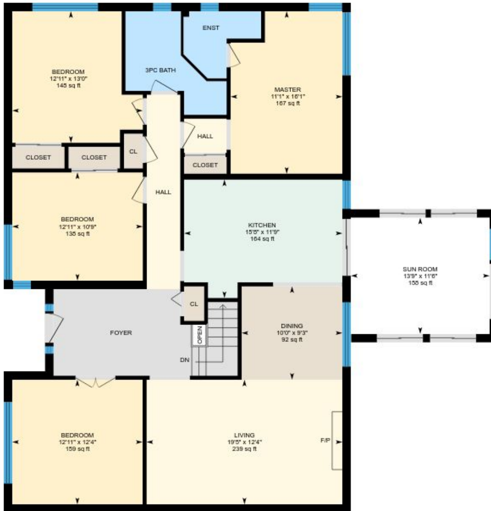
Main Floor Exterior Area 1697 sq ft

Main Building: Total Exterior Area Above Grade 1697 sq ft