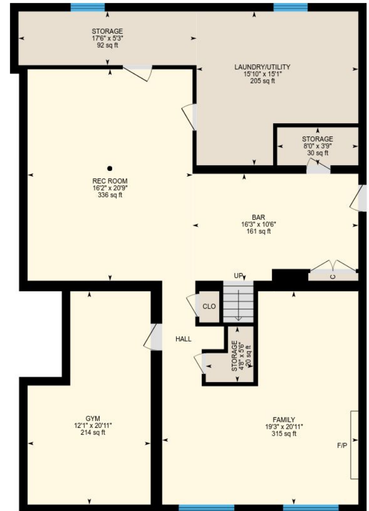
Basement (Below Grade) Exterior Area 1676 sq ft