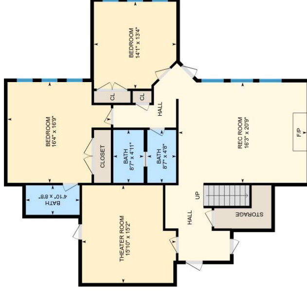
Lower Level (Below Grade) Exterior Area 1532 sq ft