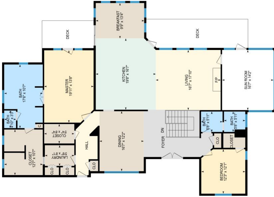
Main Floor Exterior Area 2420 sq ft

Main Building: Total Exterior Area Above Grade 2420 sq ft