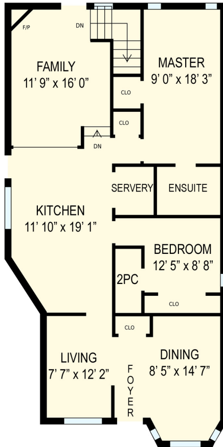
Main Floor Exterior Area 1285 sq. ft.

Total Exterior Area Above Grade 1285 sq. ft.