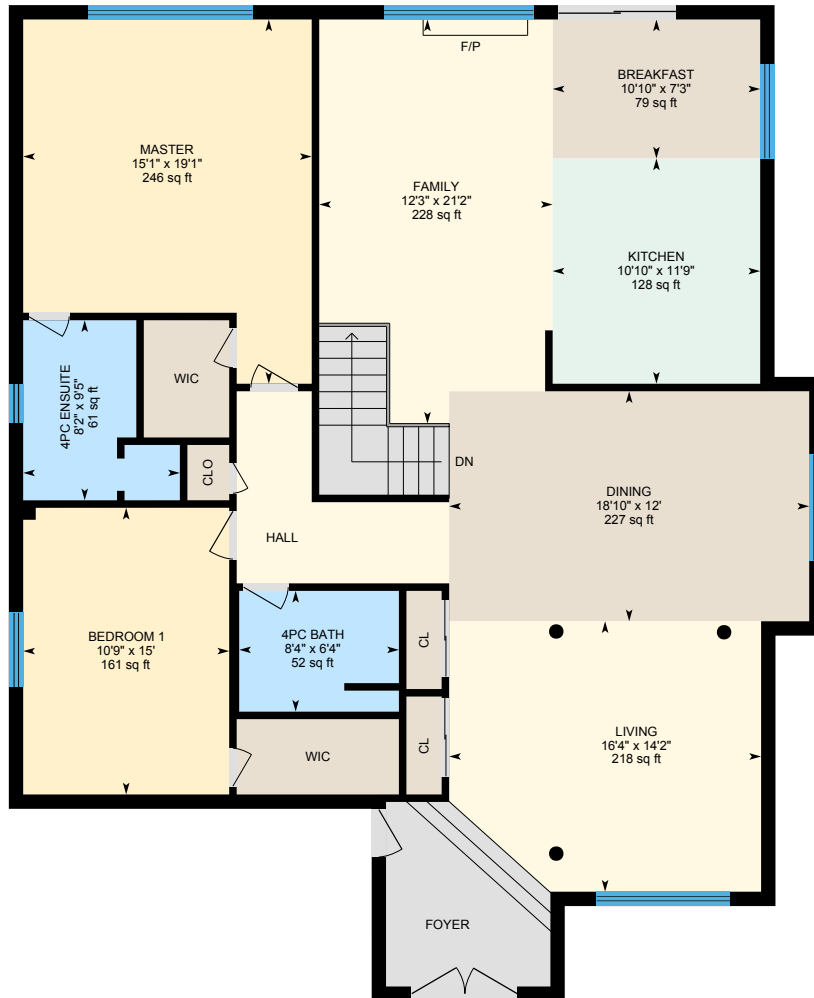
Main Floor Exterior Area 1876 sq ft

Main Building: Total Exterior Area Above Grade 1876 sq ft