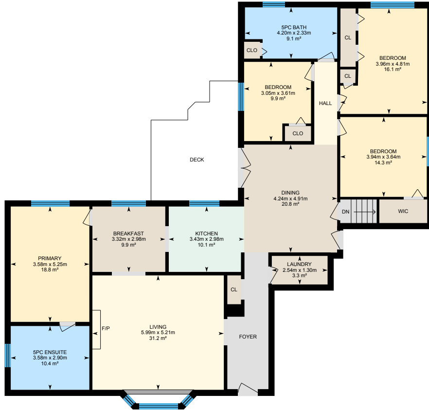
Main Floor Exterior Area 207.43 m 2

Main Building: Total Exterior Area Above Grade 207.43 m 2