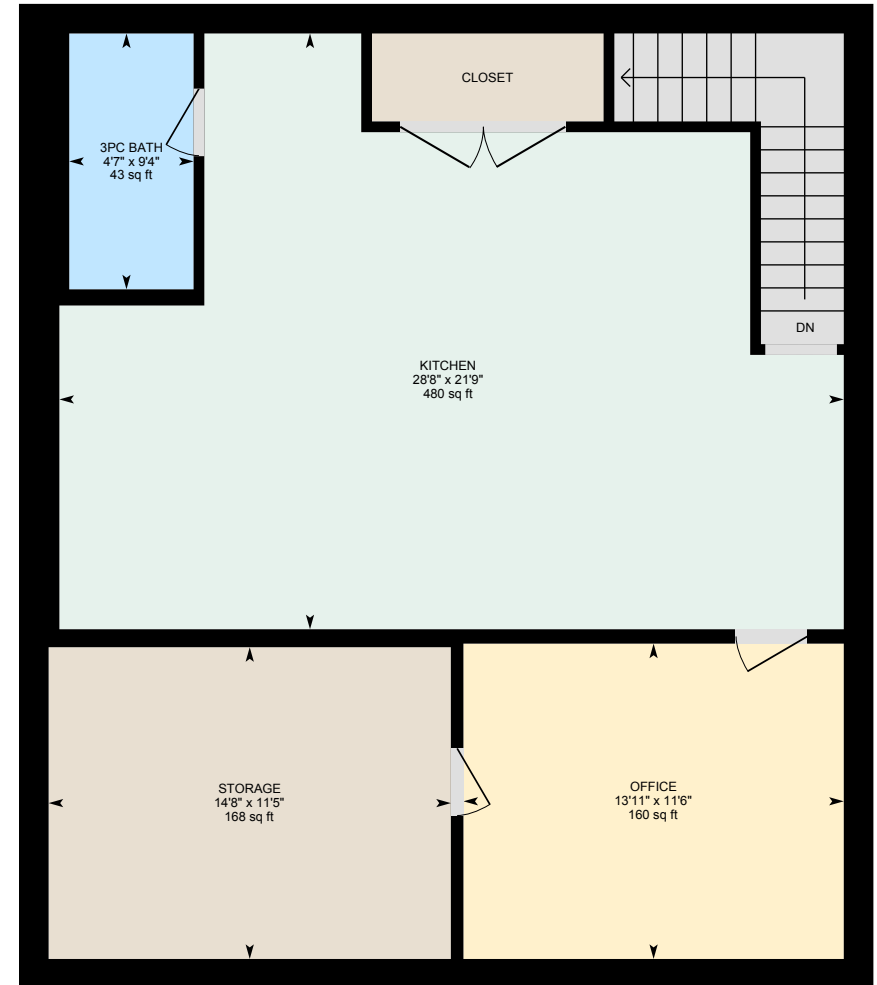
Upper Level Exterior Area 1112.32 sq ft