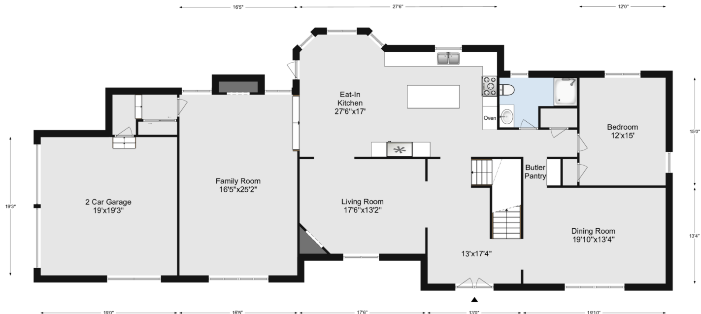
Level 1 Floor plans are intended to give a general indication of the layout. The information is considered reliable not guaranteed as accurate or complete.