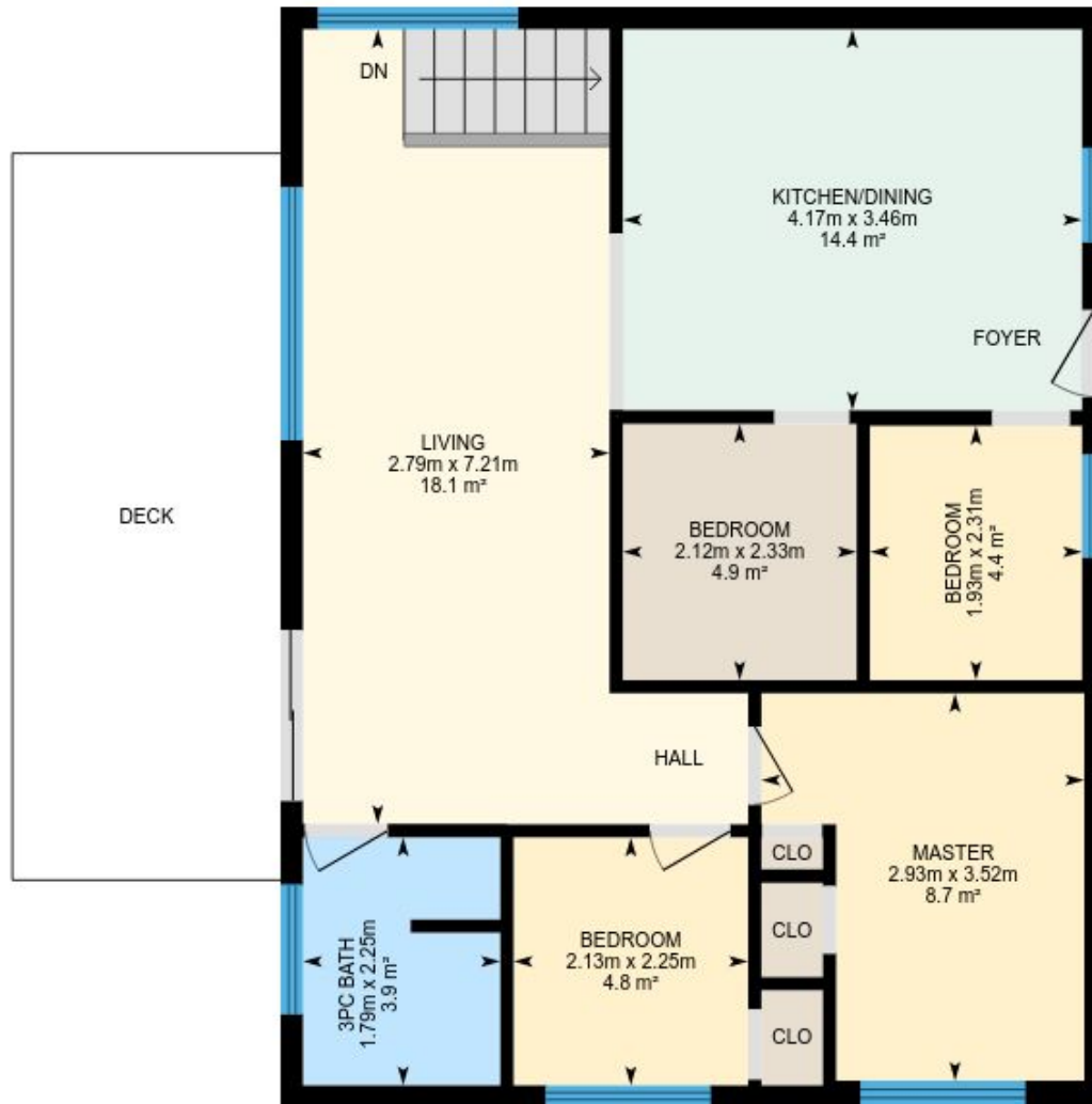
Main Floor Exterior Area 74.7 m 2

Main Building: Total Exterior Area Above Grade 74.7 m 2