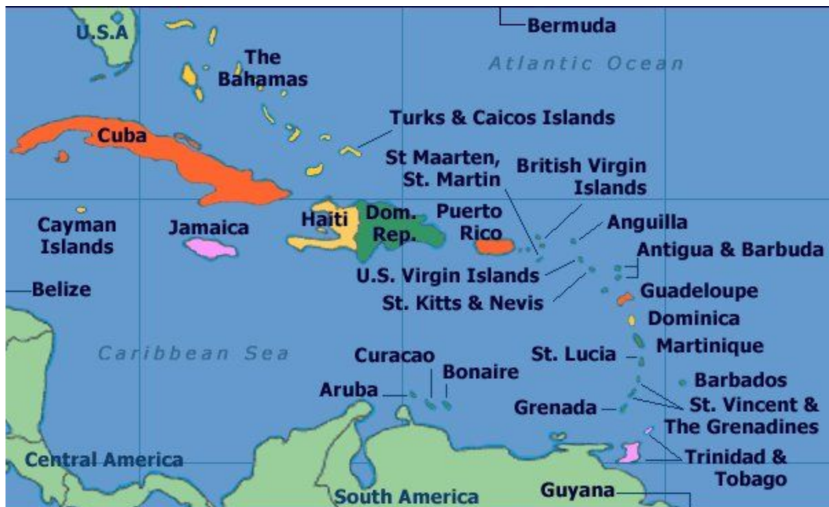
Beautiful St Lucia

The shores are pretty without losing the opportunity, of course, this place isn't one that many would call Metropolitan, you will surely love this beach if you want to enjoy and escape the buzz of the city.