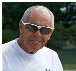
Nick Bollettieri – Legendary Coach

The Connecticut Alliance for Tennis + Education and the USTA Foundation are pleased to offer an exclusive opportunity to spend the afternoon with our nation's top coaching staff, including Nick Bollettieri, a USTA National Coach and top local coaches and pros.