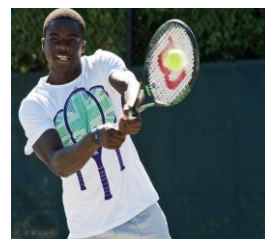
Frances Tiafoe, Age: 18, ATP Rank: 191