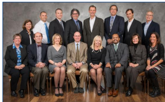
2015-16 USTA Northern Board of Directors