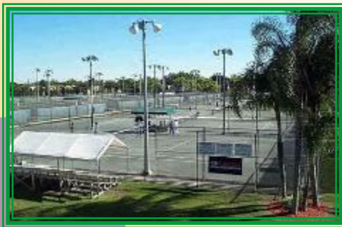
Frank Veltri Tennis Center located in Plantation, FL

The entry deadline is the same for Singles (Qualifying and Main Draw) and Doubles. There are no Doubles-only entries. Players may only enter into one age division.