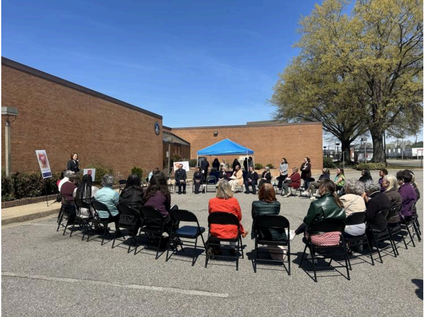
Women gathered outside of The Salvation Army Emergency Shelter at 1900 Chamberlayne Ave. on March 25th for the launch of RVA Women Lifting Up HOPE, a grassroots movement inviting all women in Greater RVA to help unlock the city's $7 million matching grant for the Center of Hope which will be built at this site.

Once the Center of Hope opens, the upgraded footprint will include a men's shelter, a family shelter, an inclement weather shelter for men and women, a commercial kitchen, dining rooms for each of the individual shelters, case management offices, and an area for city services, providing easy access for the men and women who are getting back on their feet. The number of shelter beds for men will double from 50 to 100, and the inclement weather shelter will become a permanent fixture. Beyond these rooms and services, people will feel seen, known, valued and loved, as dignity is restored and beauty is reflected at the Center of Hope.