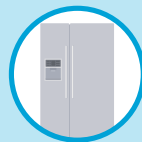
Refrigerator Door 2