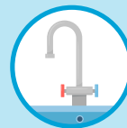
Kitchen Sink/Tap Handles