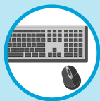
Keyboard & Mouse