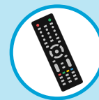
TV Remote Control