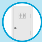
Restroom Door Handles