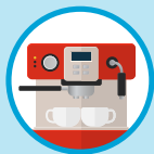
Coffee Machine Handles & Buttons 2