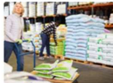
Carts & Trucks