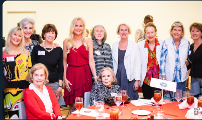
RICHMOND CHRISTMAS MOTHER FUND NON-PROFIT EXCELLENCE