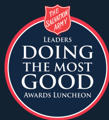
MAY 24, 2023 UNIVERSITY OF RICHMOND