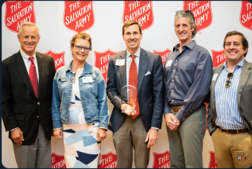
UKROP'S HOMESTYLE FOODS CORPORATE EXCELLENCE